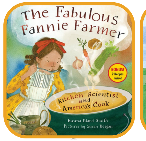
The Fabulous Fannie Farmer By Emma Bland Smith Illustrated by Susan Reagan

For participating in Reading Makes Cents, your library will receive the following books with library binding for FREE :