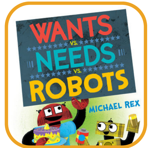
Wants vs. Needs vs. Robots