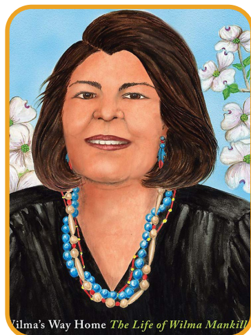
Wilma's Way Home: The Life of Wilma Mankiller Doreen Rappaport

For participating in Reading Makes Cents, your library will receive the following books with library binding for FREE: